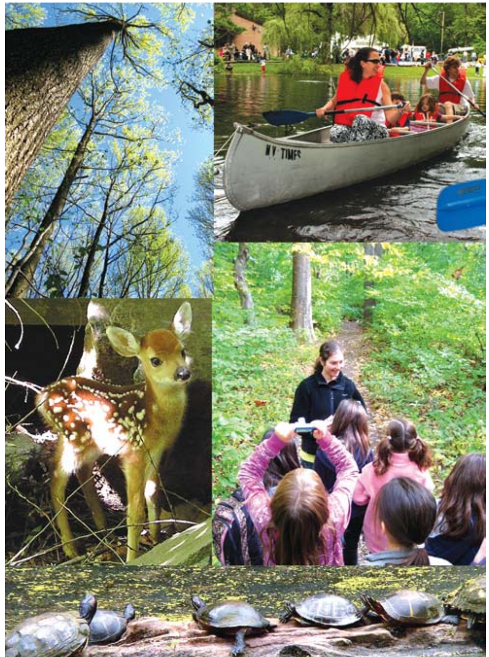
Clockwise: The forest turns green once more; Nature Day canoeing on Quarry Pond; classes discover nature under the trees, the turtles of Quarry Pond climb back on their log, a newborn fawn in the Native Habitat.