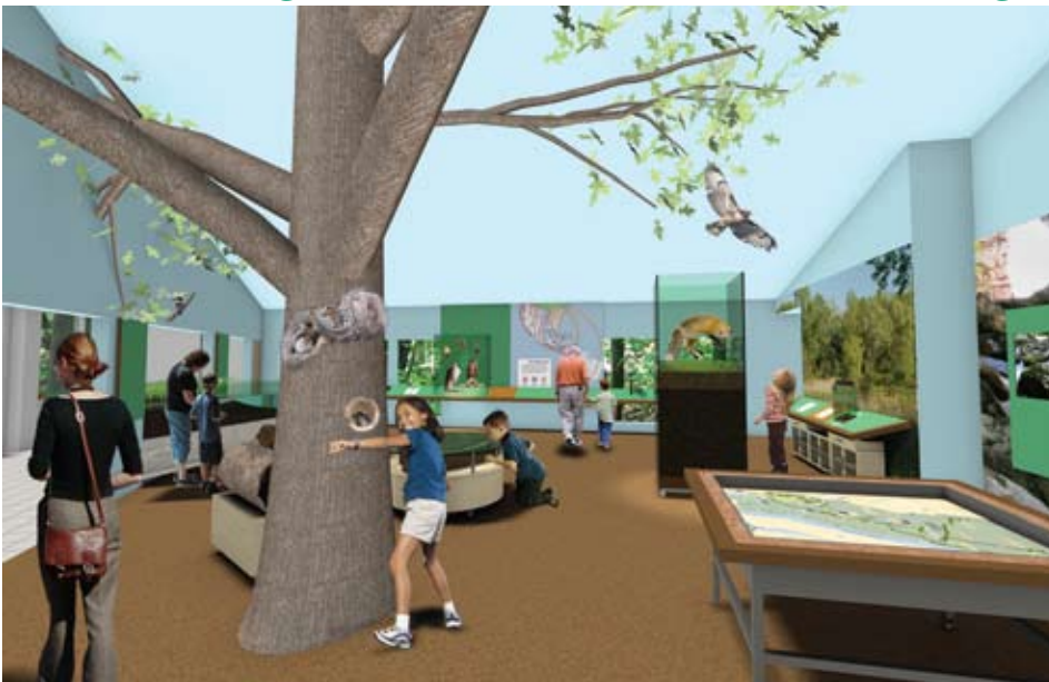
Exhibit Design Previewed at Annual Meeting

The design for Flat Rock Brook's planned exhibit “A Walk in the Woods” was previewed at the Association's Annual Meeting on September 20th. The model pictured above shows the main room from the entry doors. The exhibit will examine the various habitats found at Flat Rock Brook—forest, meadow, pond and stream, bird life and the watershed and show the interdependence of the natural world and how human actions impact the environment. Contact the Nature Center for more information. Designs for the exhibit were created by Evidence Design located in New York.